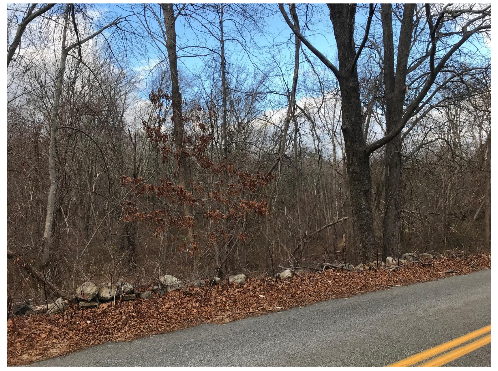
2. View from Natick Avenue