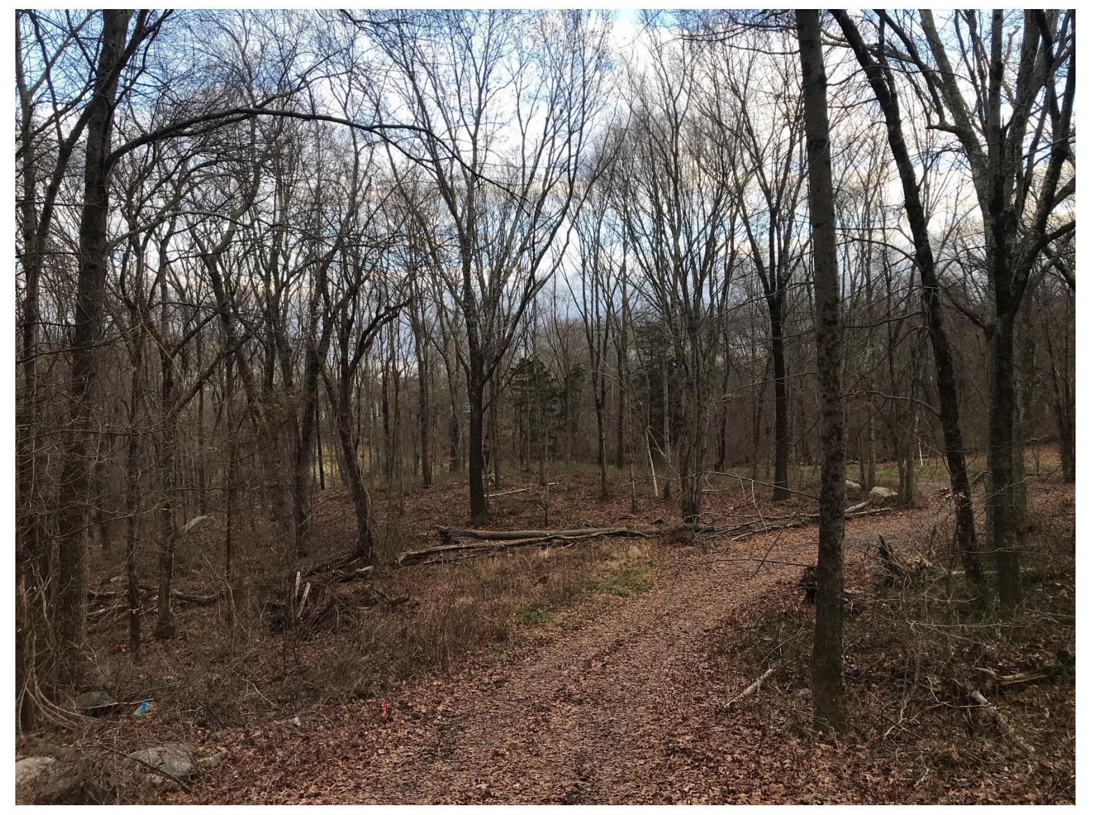
4. Looking toward Natick Avenue