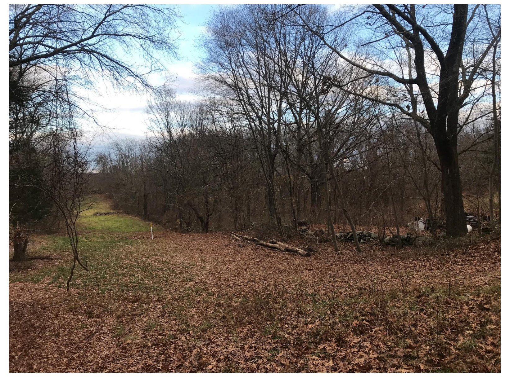
3. Looking toward Natick Avenue