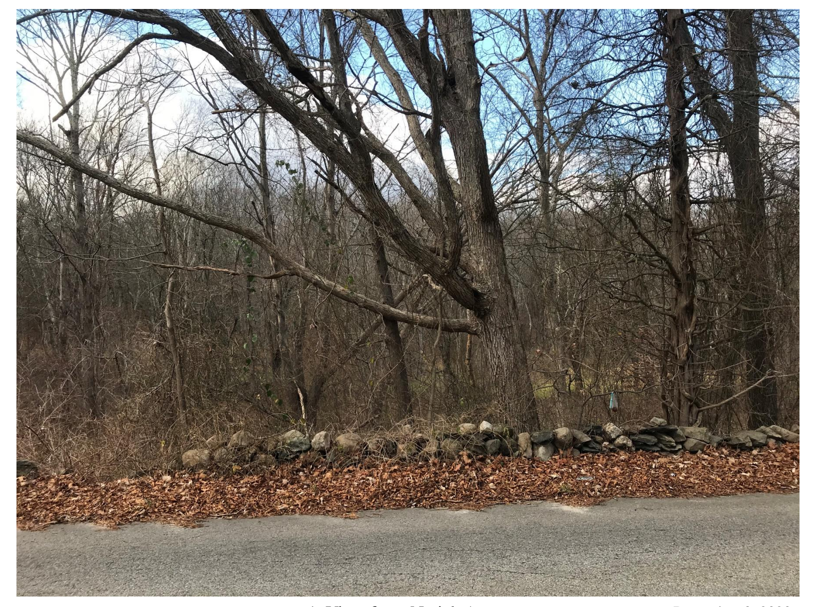
1. View from Natick Avenue