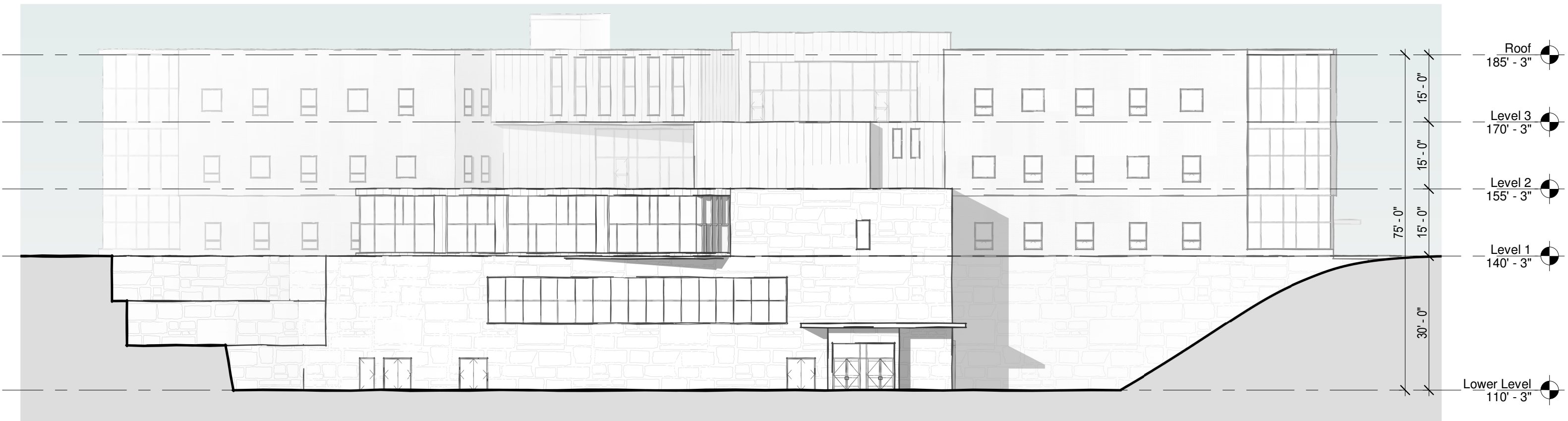
1 Exterior Elevation - South 3/64" = 1'-0"