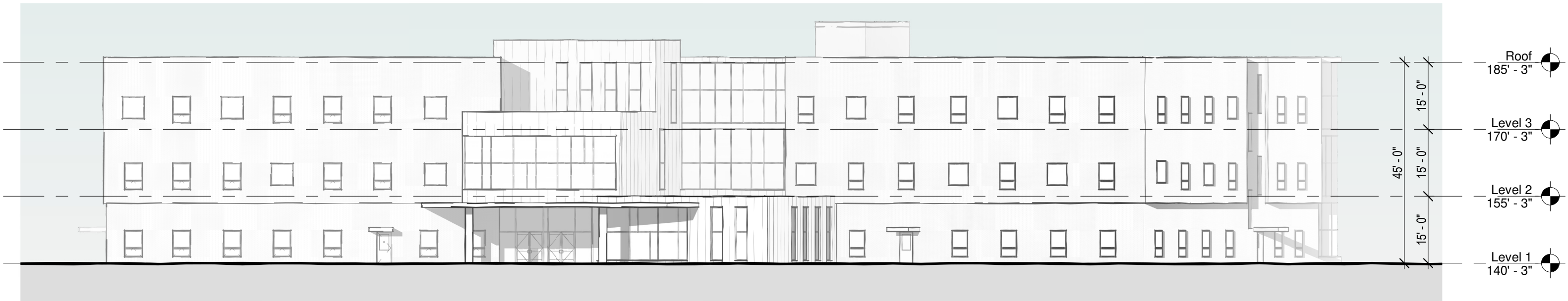
2 Exterior Elevation - North 3/64" = 1'-0"